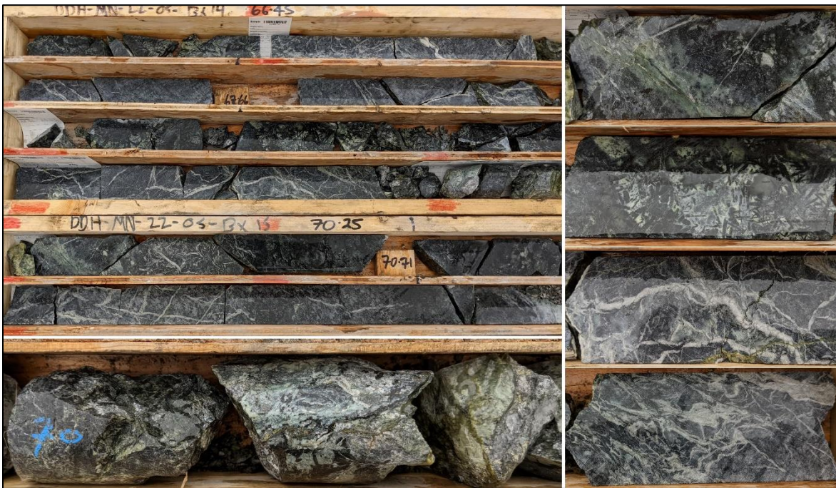
Figure 3. NQ2 diameter core showing section of MN22-05 66–72 metre interval with serpentinization and silicification of peridotite, multi-stage deformation and veining with quartz, pyrite, chalcopyrite, galena, chlorite and carbonate. Lower left – broken core in visible gold interval with light to very dark green serpentine from 69.95m. Right – intense alteration and textural styles in mineralized zone.